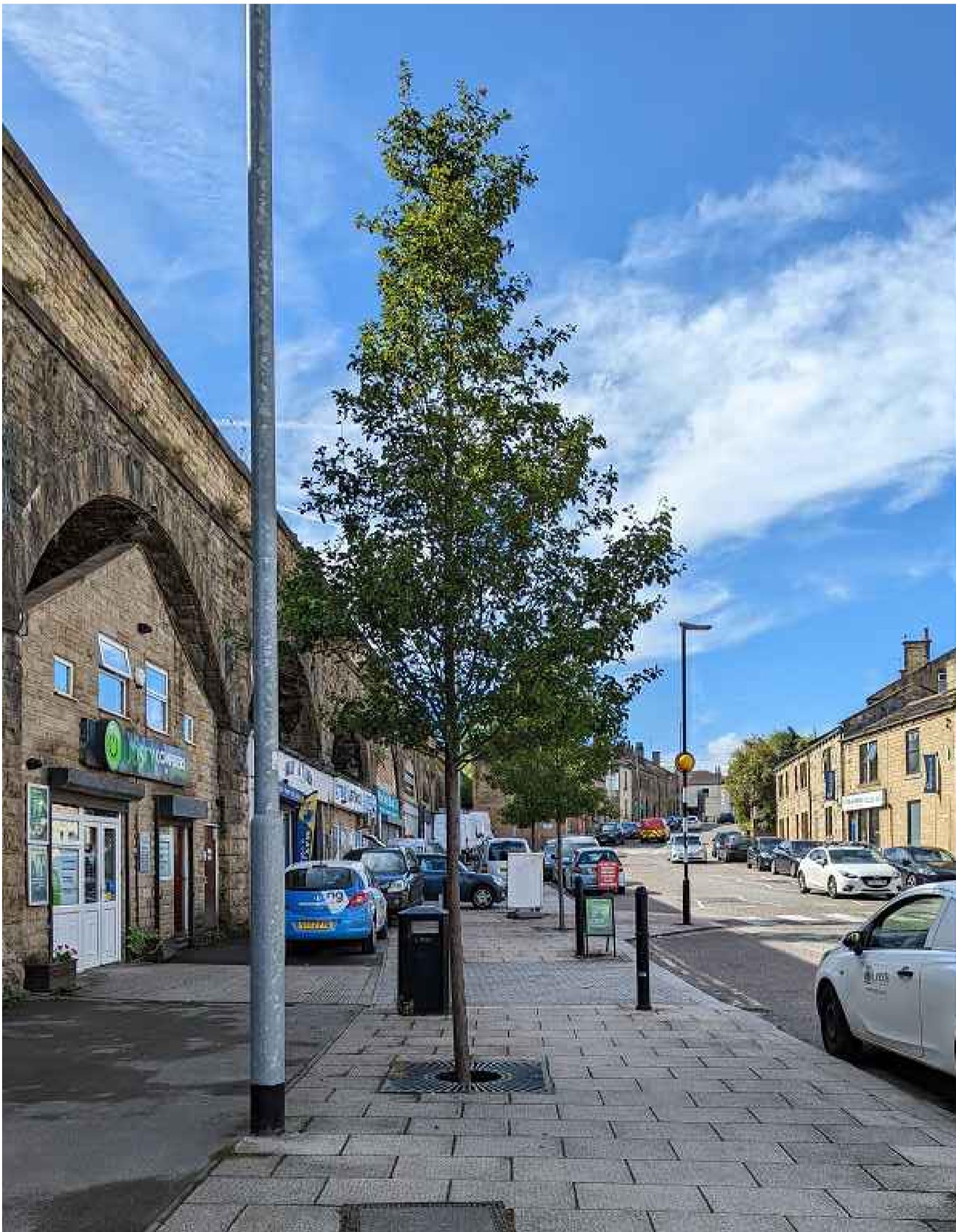
Example tree planted in tree pit at Stanningley Bottom. Tree planted in 2015.

Copyright © 2022 Leeds City Council. All rights reserved. This drawing is the property of Leeds City Council. It must only be used for the purpose for which it was originally supplied. It must not be copied, published or transmitted by any means to any third party, without the express permission of the originator. Modification or manipulation of all or part of this drawing is strictly forbidden, unless specifically requested or approved by the originator.